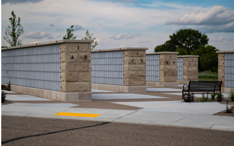
2023 Newly Constructed Columbarium

Operational & Equipment Costs in 2023/24 - $250,000